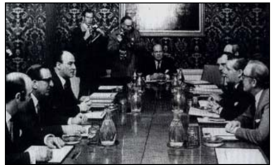
Source E. The Conference held at Marlborough House in 1972 between Lord Carrington and Dom Mintoff.