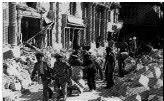
Source C. Volunteers in search for air-raid victims during World War II.