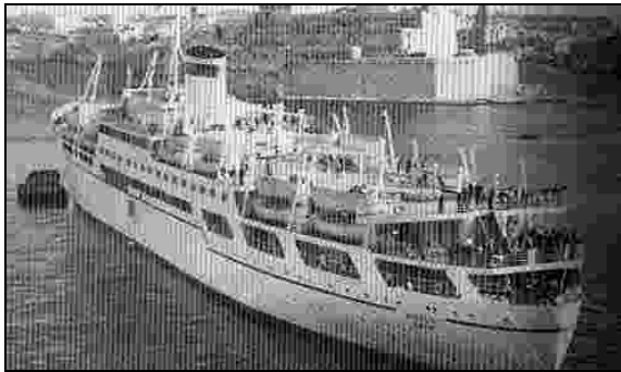
Source B. Maltese emigrants leaving for Australia.