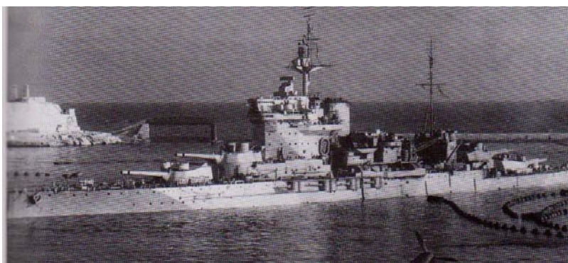
Source A. British Navy ship in Malta's Grand Harbour

1. Look carefully at the following source and then answer all the questions.