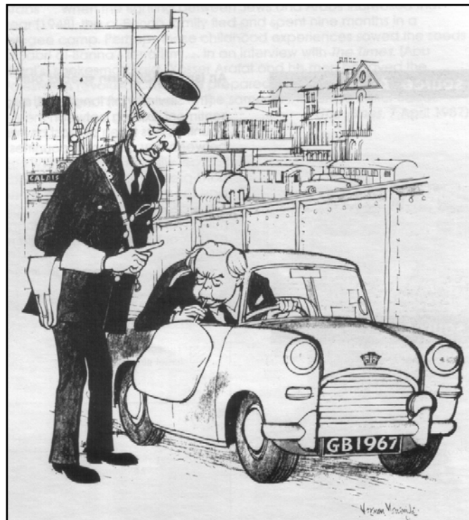
"I suspect you of driving under the influence of America."

According to the cartoonist, why was Britain refused entry to the EEC in 1967?