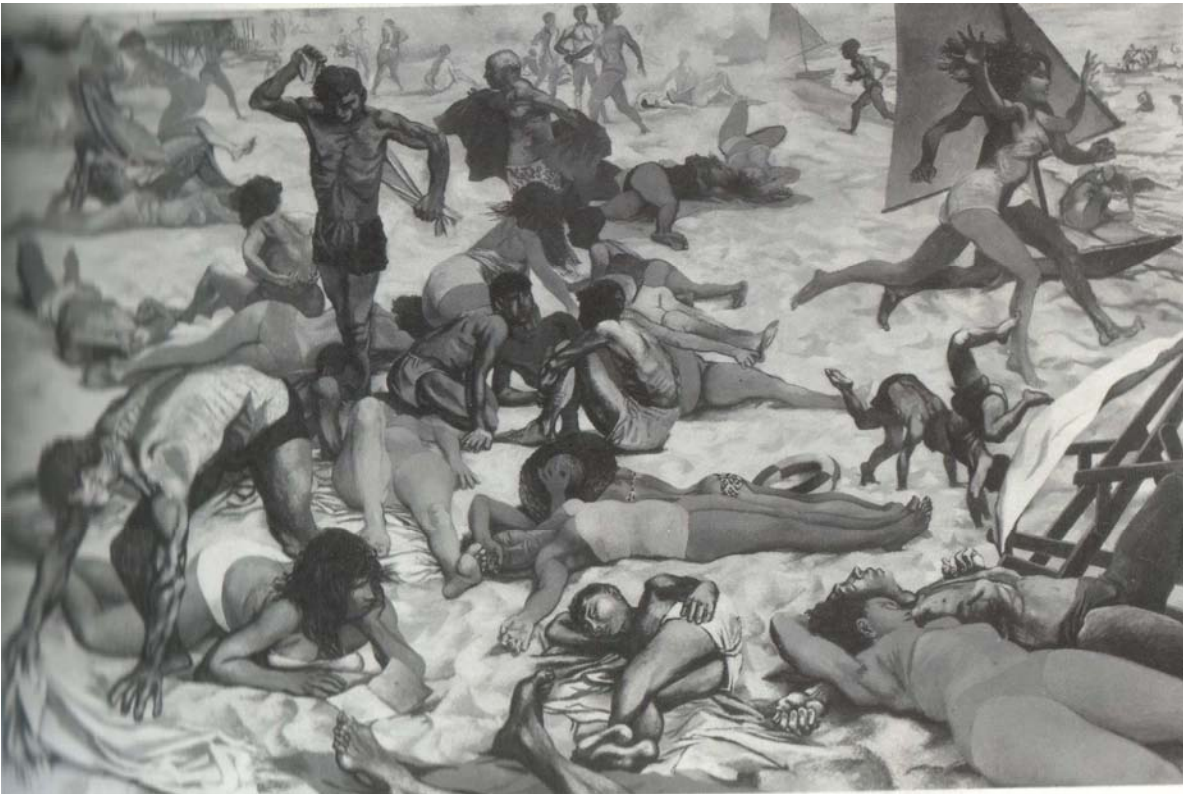
Figure 1: Beach – Renato Guttuso