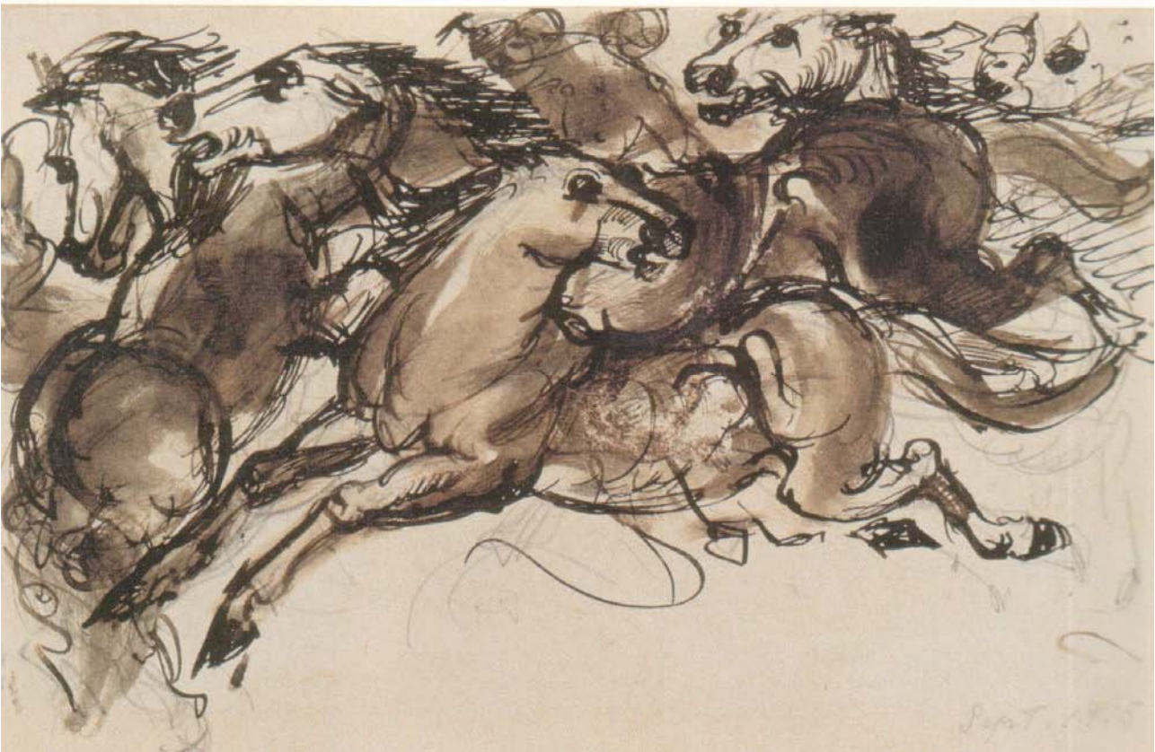
Figure 2: Rush of Horses – Franz Marc